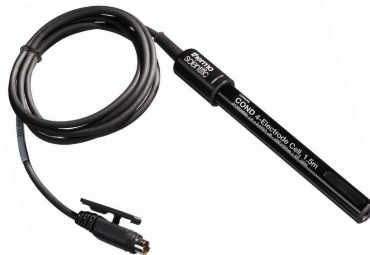
DuraProbe Rugged 4-Electrode Lab and Field Probe with 1.5 m cable (Cat. No. 013005MD) provides accurate measurements in the lab and easy readings in the field.

Perform your measurements with confidence and consistency when you choose DuraProbe products. Our 24-month warranty can give you peace of mind as you collect data from highly conductive samples time and again.